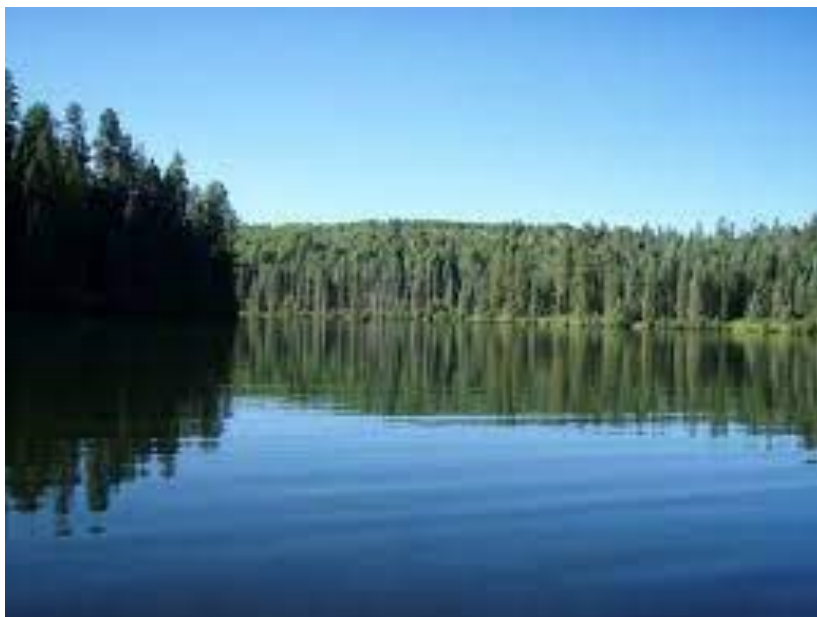
CHRISTMAS TREE LAKE—WMAT

Christmas Tree Lake is the Department's premier trophy Apache Trout fishery. This fishery is catch-and-release only for Apache Trout. There are many Brown Trout in the lake as well, which can be harvested up to the daily bag limit of 5 fish. Over 1,500 Apache Trout up to 20 inches have been stocked into Christmas Tree Lake during 2022 with the final stocking of the year occurring in June. Many Apache Trout from previous years remain in the lake and daily catches of several dozen fish are commonly reported here. Although the hatcheries have significant challenges to overcome to meet production targets in the coming years, the Service and Department are committed to maintaining the current stocking program at Christmas Tree Lake.